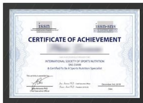
ISSN-SNS Certificate example